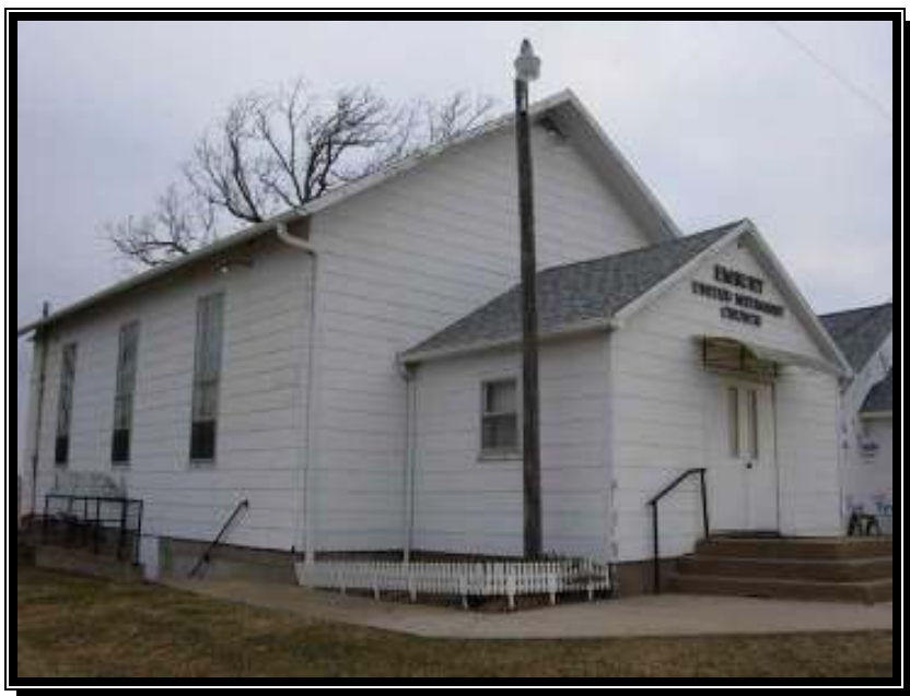
Embury United Methodist Church (photo taken by Kathy Kult on March 15, 2007)

Now our church is 125 years old and these are our blessings and accomplishments since 1969. The following new furnishings have been added: an organ, piano, memorial and guest books and stands, a handcrafted sanctuary clock, new hymnals, a furnace, ceiling fans, floor tile and carpeting, three utility cupboards, an electronic keyboard, folding chairs and window shades in the sanctuary. Improvements to the building and